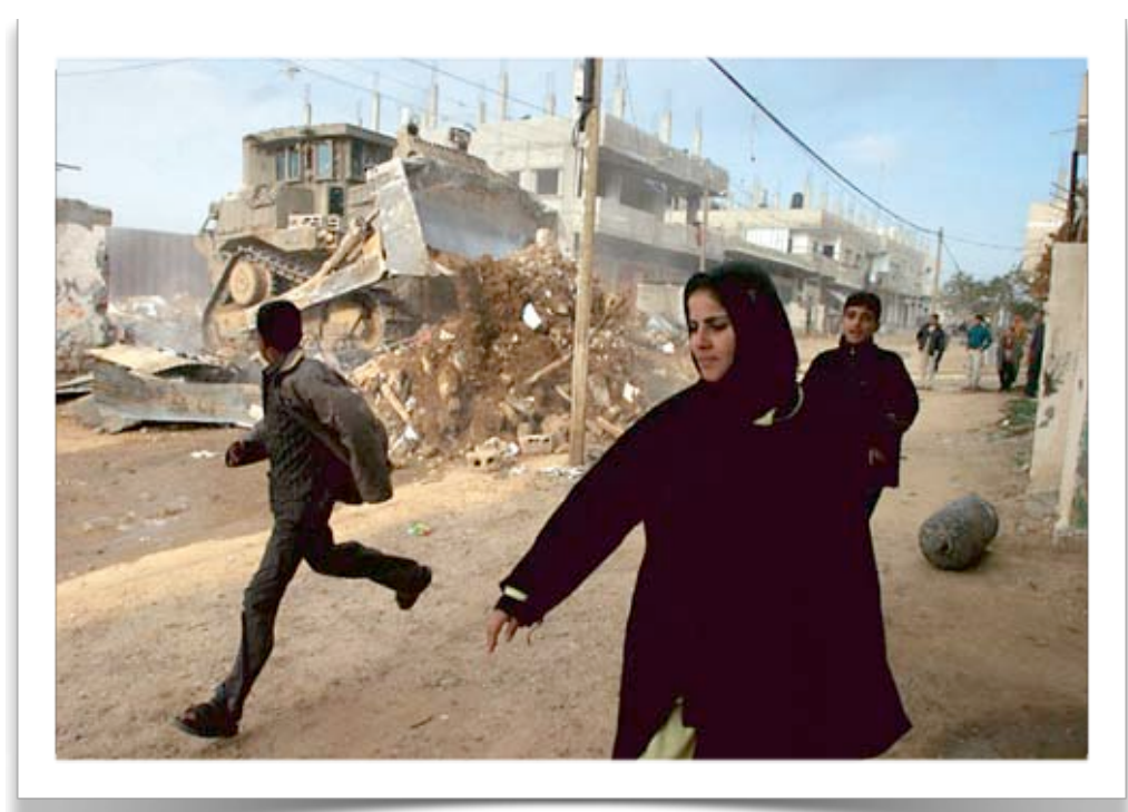
Palestinians flee from a Caterpillar D-9 demolishing a home in Rafah, 2004.

under a CAT bulldozer when she tried to protect the home of the Nasrallah family in Gaza from an Israeli army demolition.